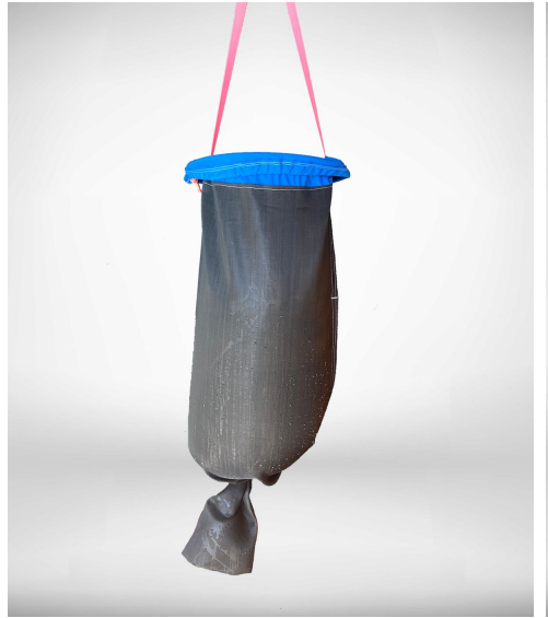
Vacuum Truck Friendly - VTF trash & debris > 0.6 mm Industrial strength polypropylene mesh