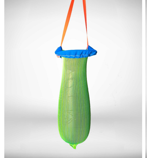
100% Total Trash Capture - TTC trash & debris > 4.0 mm High strength polypropylene net