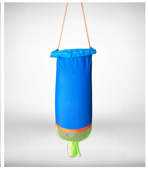
Sediment, Hydrocarbons, Heavy Metals, & Trash - SHHT MYCELX Performer media, MYCELX Snippets & FCP media