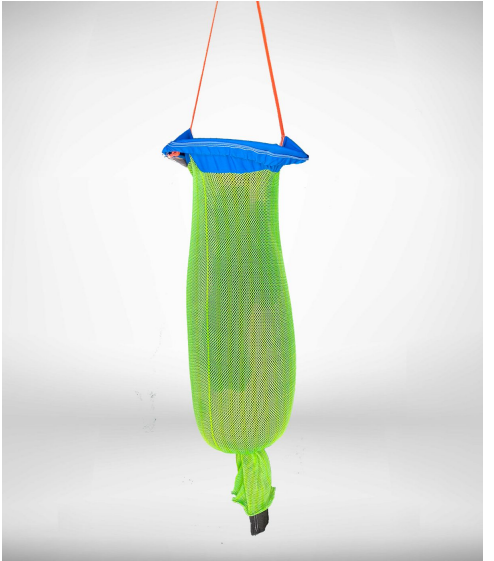
Trash, Debris & Sediment - TDS TSS capture Geofabric with 0.212 particle size removal capabilities