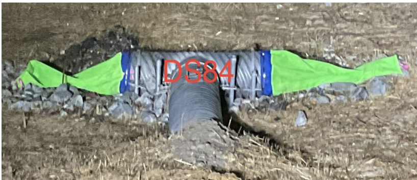
California Department of Transportation (CALTRANS) Installation

1 CFM = 7.48 GPM = 28.3 L/min 1 gal = 3.79L - 8.34 lbs H 2 O 1 m 2 = 10.76 ft 2 1 acre = 43,560 ft 2 /acre 1 Bar = 14.5 PSI at sea level 1 in = 2.54 cm 1 mile = 1.61 km gutter sand SG = 2.2