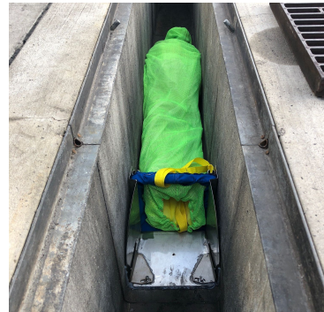
Channel Filter System