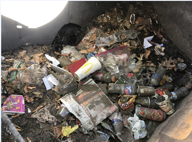
storm drain prior to Gutter Bin installation - Denver

Stormwater pollution is the single greatest source of water pollution today. Every time it rains, stormwater washes the filth on our streets directly to local waterways. The vast majority of stormwater isn't treated or filtered. It simply drains to the closest body of water along with all of the trash, sediment, heavy metals and oils that it picks up along the way. Gutter Bins stops this terrible thing from happening.