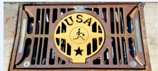
Corner of Tejon & Colorado - Colorado Springs

Seriously, we're not kidding. Gutter Bins have service lives of 25 years and have multiple branding opportunities including customized grate hatches and stainless steel badges.