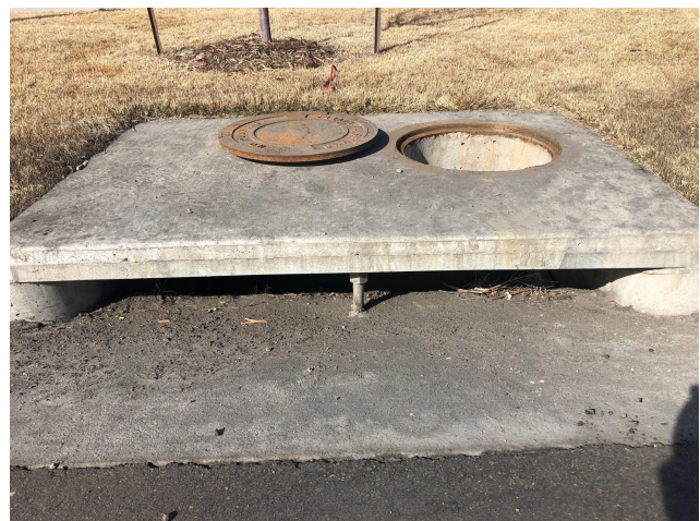
typical Type-R (14) curb inlet